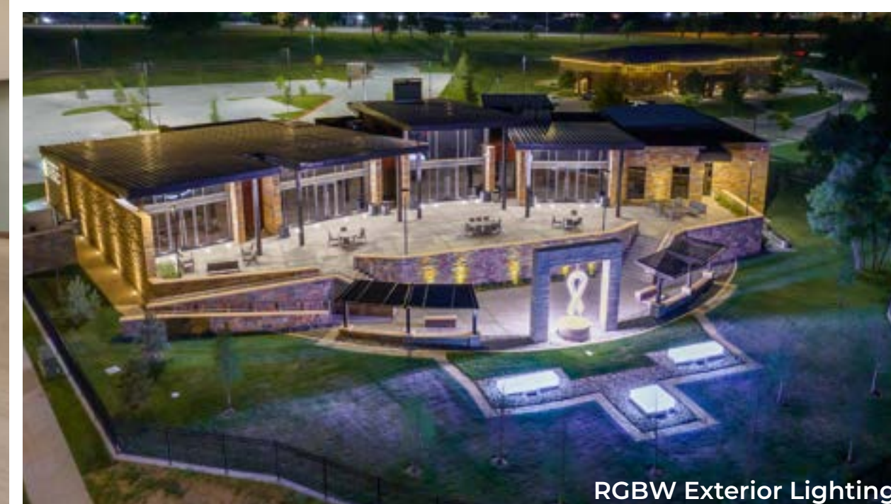
RGBW Exterior Lighting