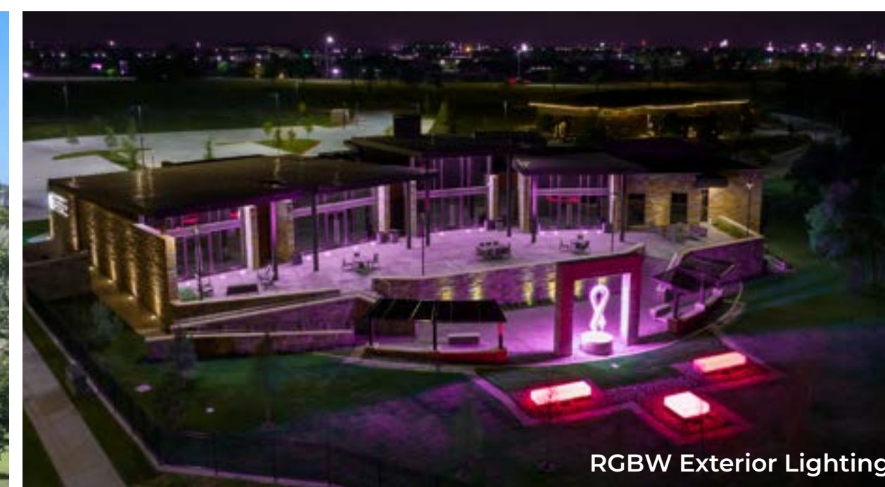
RGBW Exterior Lighting