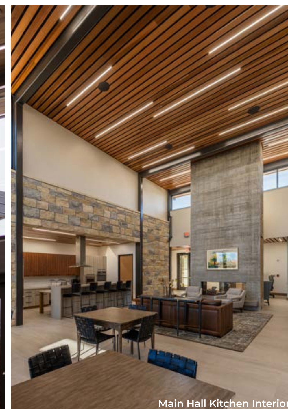
Main Hall Kitchen Interior