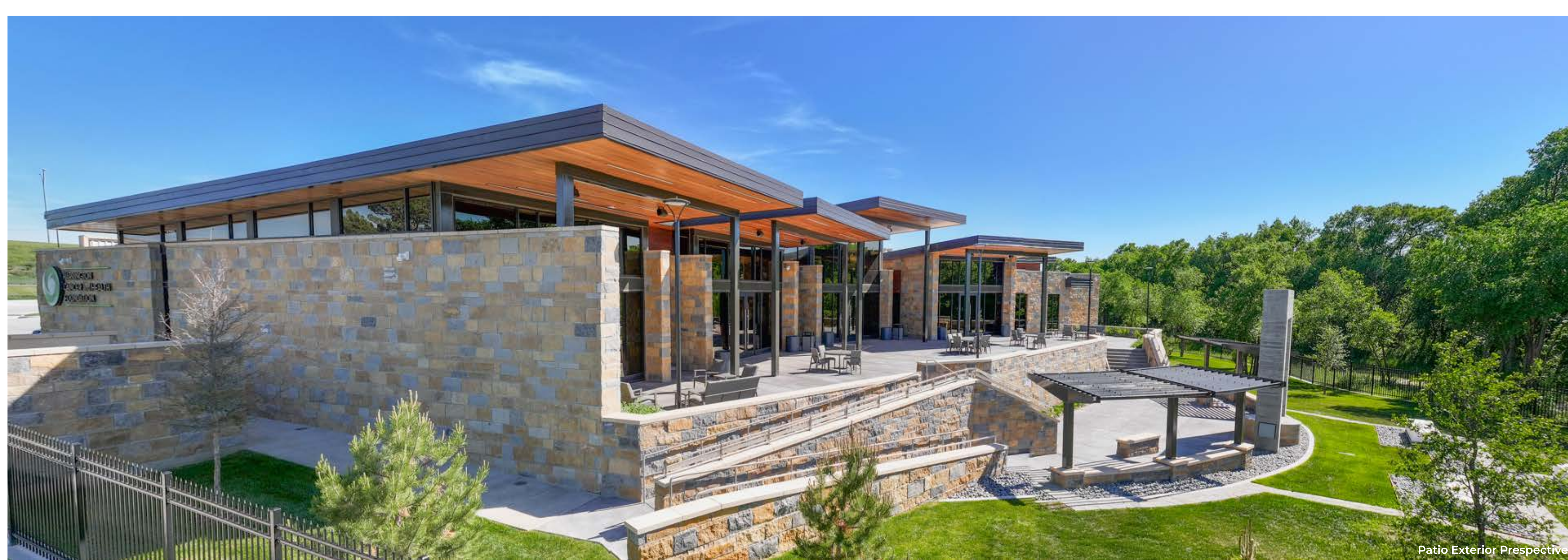
Patio Exterior Perspective